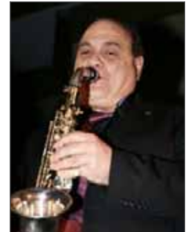
Live entertainment by New Image Band