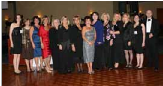
The wonderful 2010 Possible Dream Gala Committee