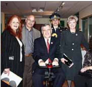
The Honourable David C. Onley, Lieutenant Governor of Ontario proudly opened the exhibition