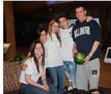
Students from St. Thomas of Villanova team up to make dreams come true