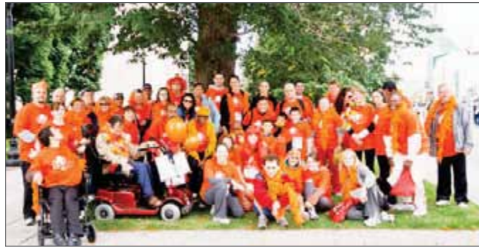
2010 Team Match Muki who scooted, walked and ran the 5 km together