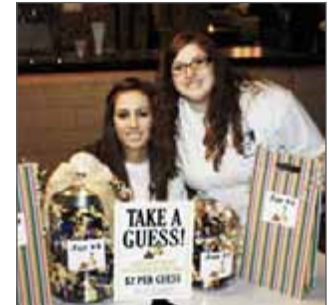
Eager to sell as many raffle tickets as possible

“ Without the ongoing loyal support from the community at large, we would not be able to do what we do for the children and adults that we serve.