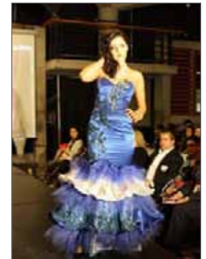
SCA Charity Fashion Show